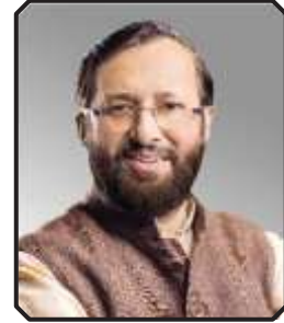
Prakash Javadekar Minister of Human Resource Development Government of India

Government of India Ministry of Human Resource Development