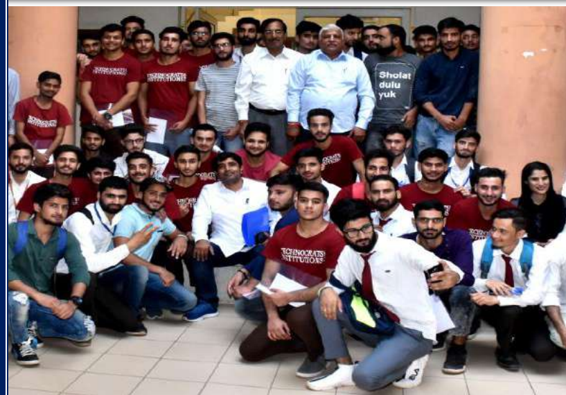
Interactive Session at IES College of Technology, Bhopal on 10 th October, 2019