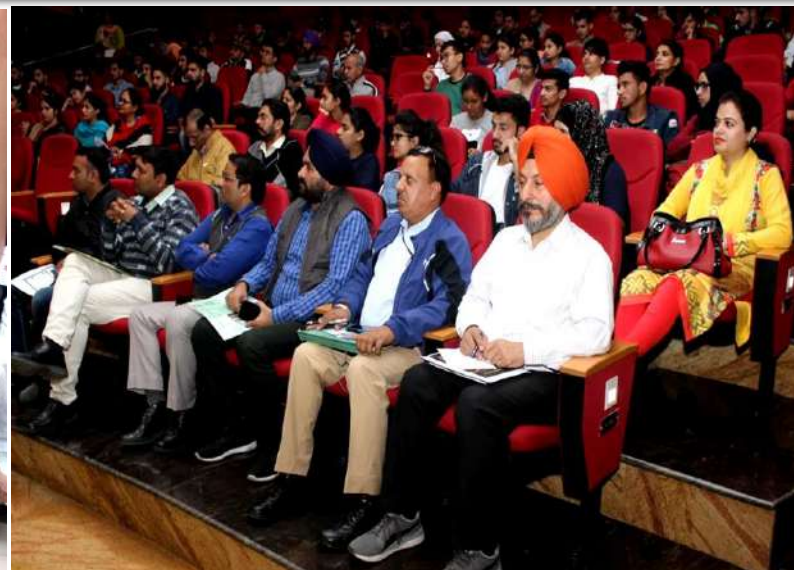
Interactive Workshop for PMSSS Beneficiaries at NITTTR, Chandigarh on 18 th November, 2019