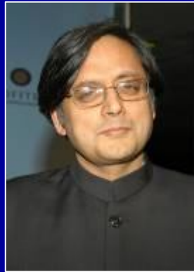
Dr. Shashi Tharoor Hon'ble Minister of State for Human Resource Development