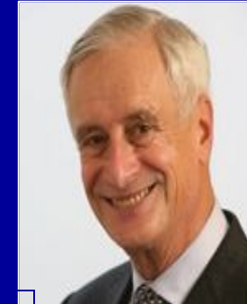
Prof. Robert S Kaplan Marvin Bower Professor of Leadership Development Emeritus, Harvard Business School