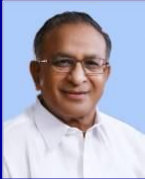
Mr. S Jaipal Reddy Hon'ble Minister for Science & Technology